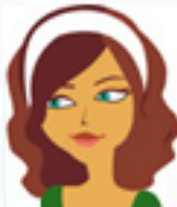
Sister in law